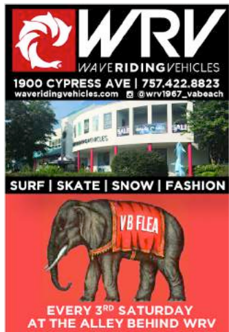
WRV WAVE RIDING VEHICLES 1900 CYPRESS AVE | 757.422.8923 waveridingvehicles.com @wrv1967_vabeach