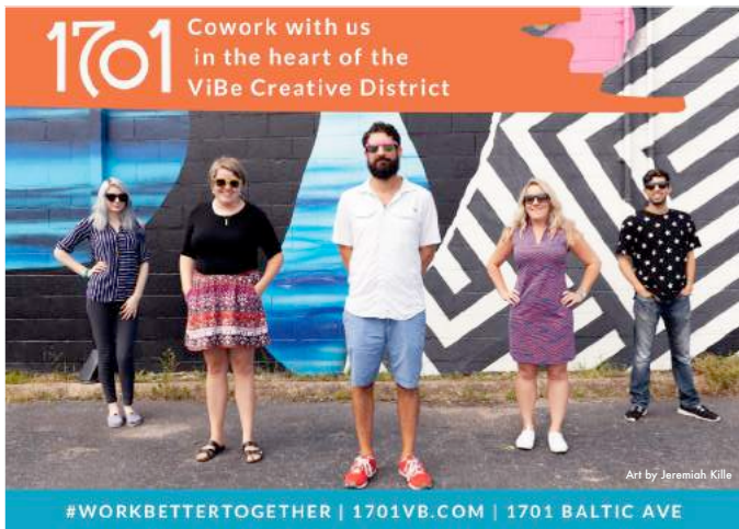
#WORKBETTERTOGETHER | 1701VB.COM | 1701 BALTIC AVE

Nestled within the Oceanfront area. Virginia Beach's own cultural arts enclave - the ViBe Creative District. A hub for over 100 artists and creative businesses - including spirits, roasters and restaurants, workouts and wares, museums and more - the ViBe is where our creative businesses have set up shop to share their passion and inspire a sense of discovery in locals and visitors alike. Virginia Beach's first arts district is anchored by the Virginia Museum of Contemporary Art (MOCA) and has artisanal shops, art studios, vintage boutiques, luxury and antique furnishing specialists, a variety of culinary arts, and even a local craft distillery. Whether you're here for a few days or here for good, there's always something special going on.