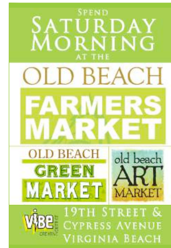
19TH STREET & CYPRESS AVENUE VIRGINIA BEACH