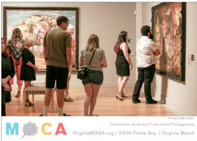
Art by Todd Schorr VirginiaMOCA.org | 2200 Parks Ave. | Virginia Beach