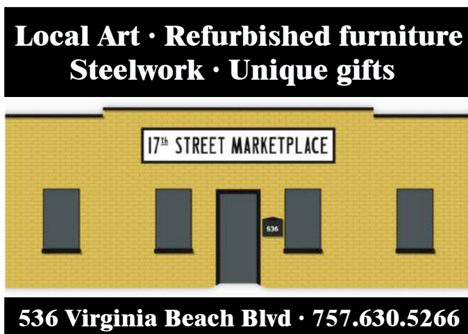
536 Virginia Beach Blvd • 757.630.5266