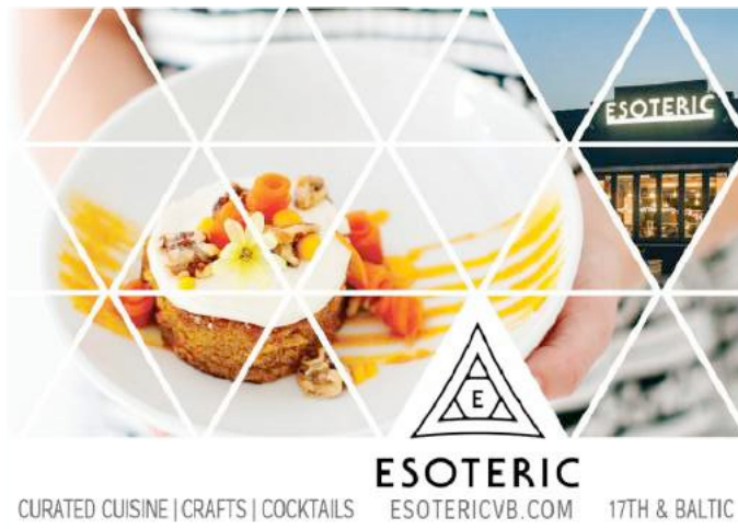
ESOTERIC CURATED CUISINE | CRAFTS | COCKTAILS ESOTERICVB.COM 17TH & BALTIC