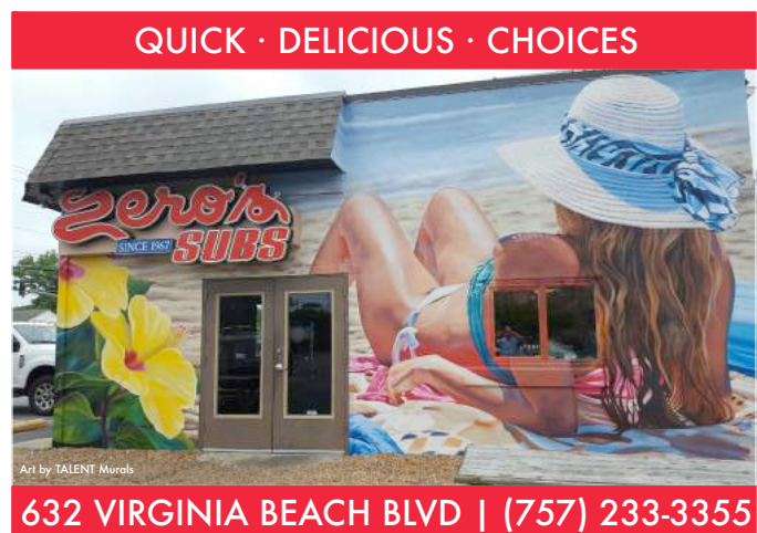
632 VIRGINIA BEACH BLVD | (757) 233-3355