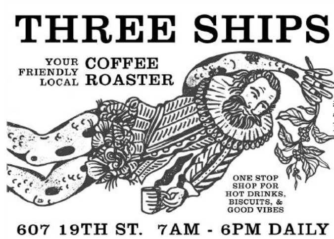
THREE SHIPS YOUR COFFEE FRIENDLY LOCAL ROASTER ONE STOP SHOP FOR HOT DRINKS, BISCUITS, & GOOD VIBES 607 19TH ST. 7AM - 6PM DAILY