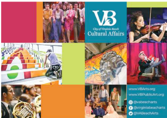
City of Virginia Beach Cultural Affairs www.VBArts.org www.VBPublicArt.org @vabeacharts @virginia-beacharts @VABeachArts