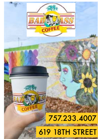
757.233.4007 619 18TH STREET