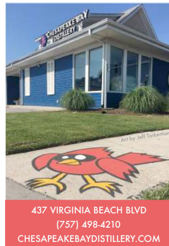
437 VIRGINIA BEACH BLVD (757) 498-4210 CHESAPEAKEBAYDISTILLERY.COM